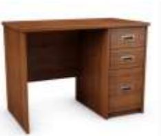
Desk with keyboard tray and 3 drawers