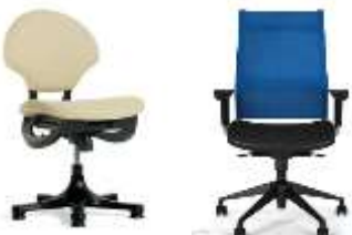
Task chair-each hall has its own style