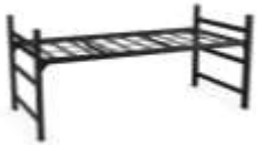
Bed frame (extra-long twin)