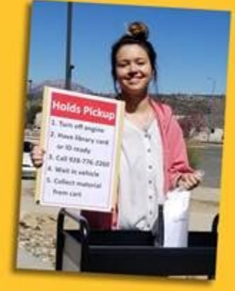
*All materials have been quarantined for 72+ hours

For more information please visit us at: www.yc.edu/library