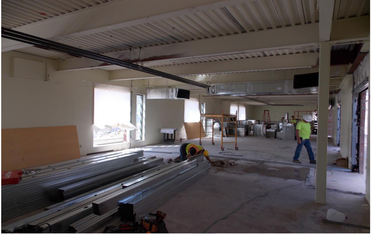
HVAC, Fire Sprinkler and Metal Stud Framing in Skills Lab