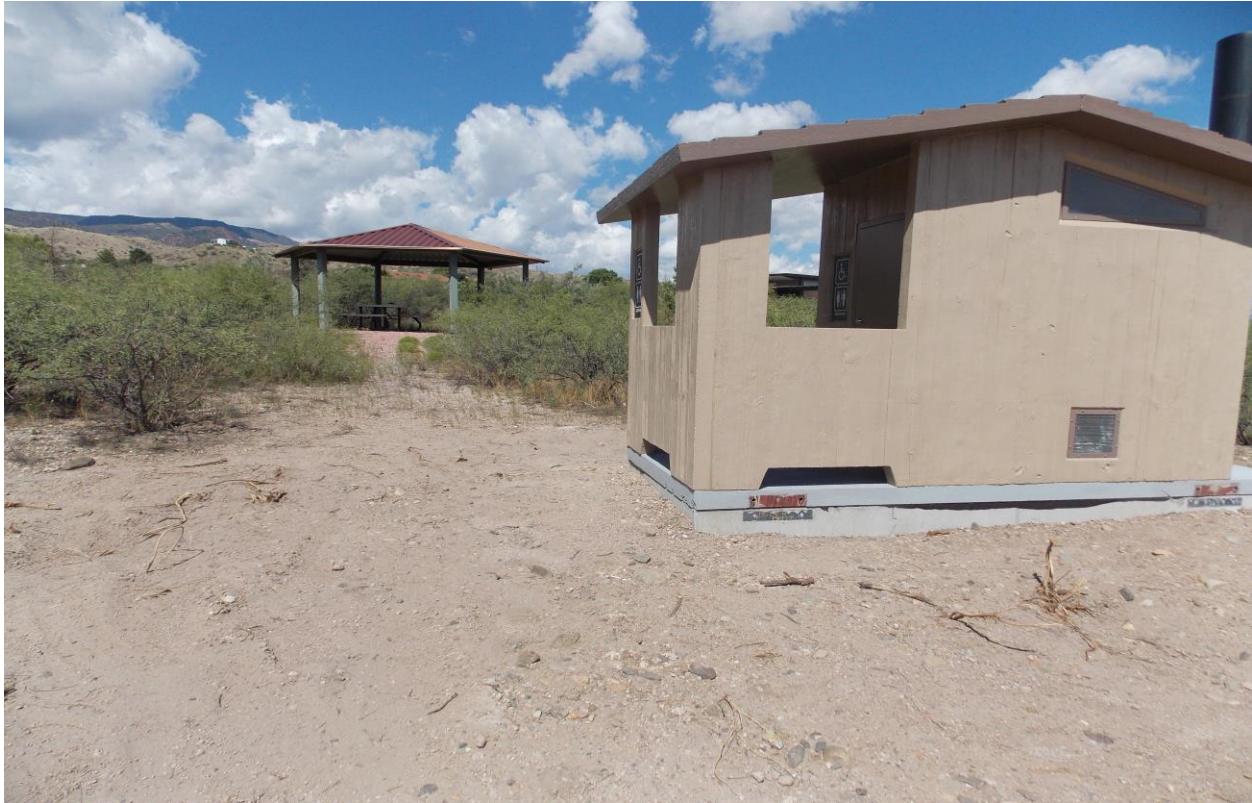
New Trail Head Restroom Adjacent to Shade Structure

Work at the Verde Valley campus trailhead continues. New restroom facility installed as work continues with landscaping.