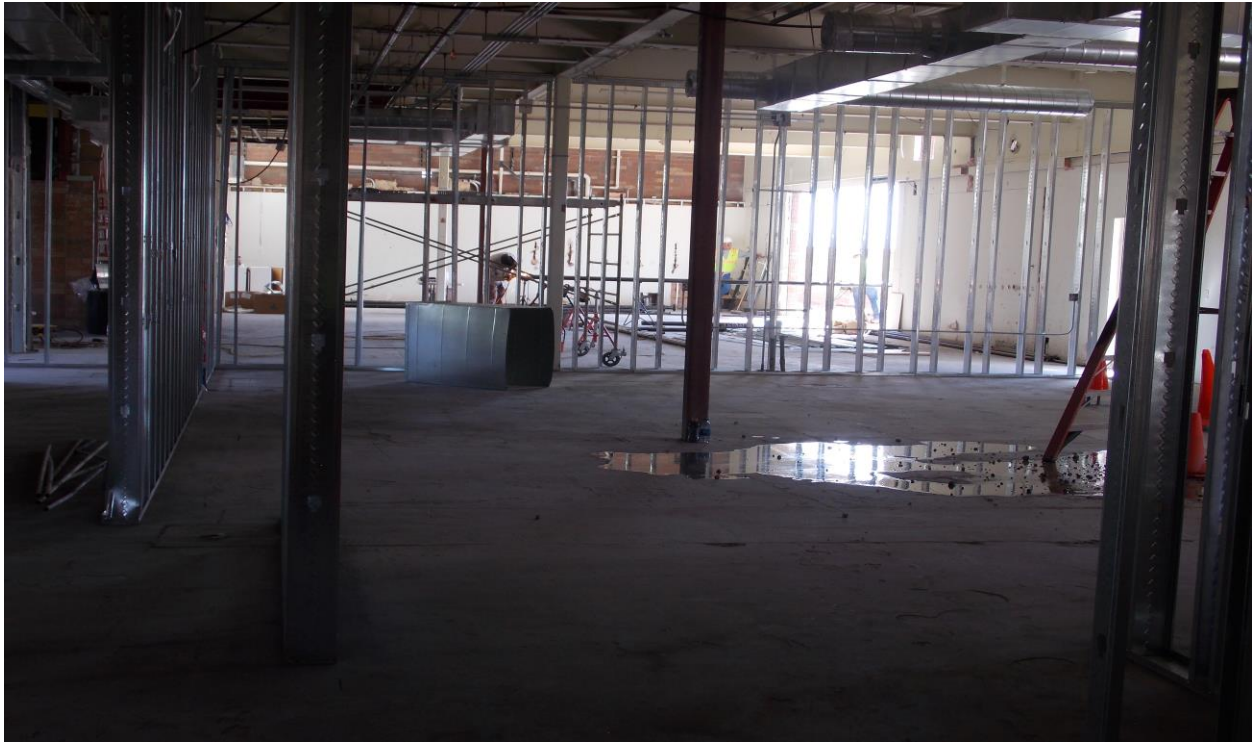
Looking East, Framing and Ductwork Installation for Science Labs

Design Team: SPS+ Architects Construction Team: Kinney Construction Services