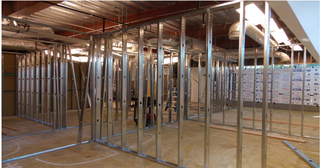
Framing of New Offices and Conference Room

Work continues renovating Rooms 103, 106 and 107 for YCF offices moving from Building 32. Work is scheduled to continue through September.