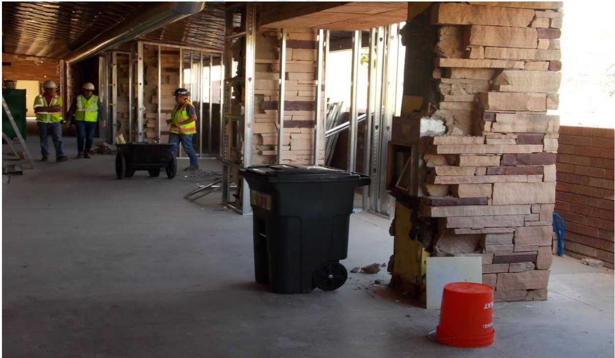
Framing Existing Columns for Eventual Enclosure of Space