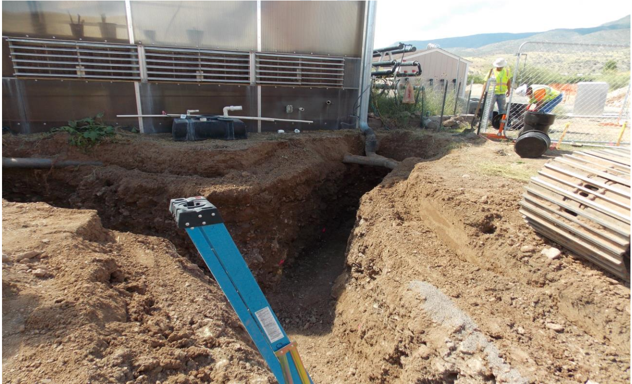
Trenching for New Drainage