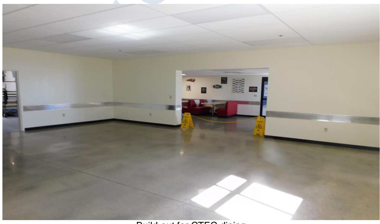
Build-out for CTEC dining

Work is complete on constructing the expansion to increase dining capacity. Furniture will be placed during the last week of April, and then the space will be opened up for use.