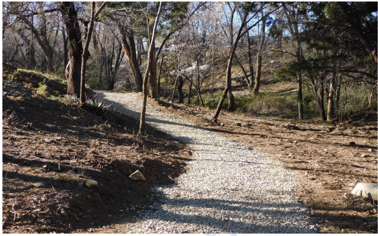
Trail behind Building 15