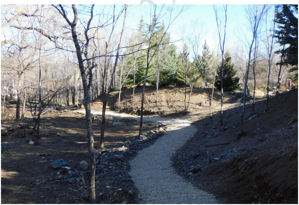
Trail behind Building 16 (Performing Arts Center) and Sculpture Garden