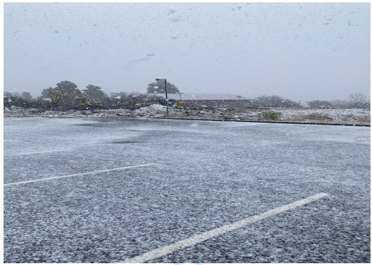
until the snow arrives!