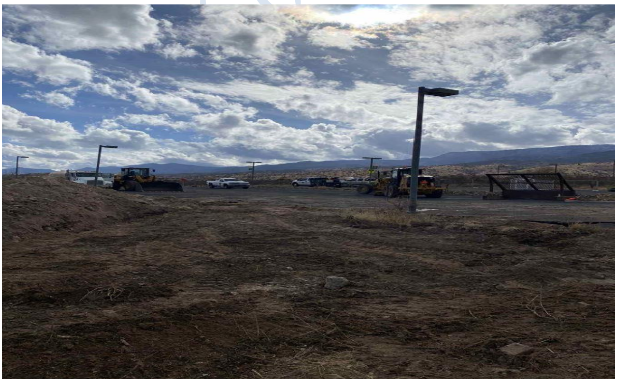
A beautiful day for construction at the Verde Valley Campus....