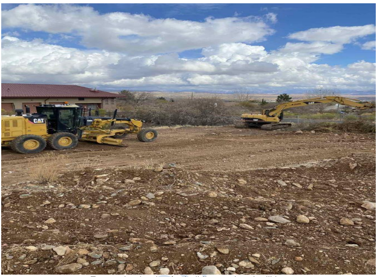
Excavation begins for building pad and utilities