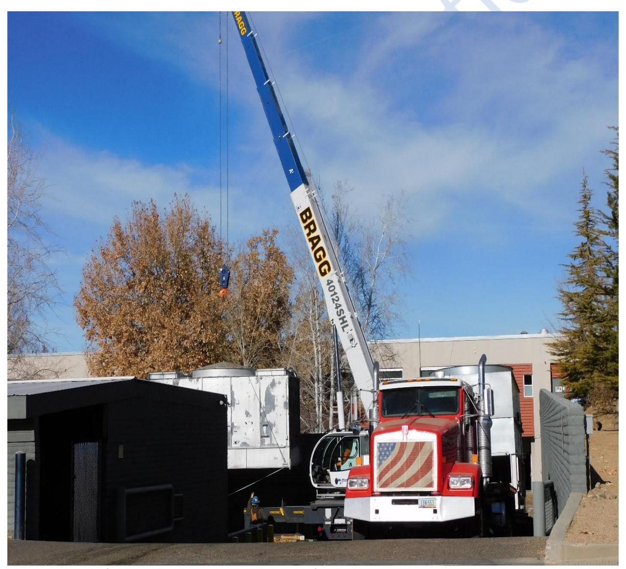
Removal of the heat exchanger as part of Building 1 boiler plant decommissioning

PAC HVAC and Roof Replacement – In design, construction anticipated to begin in Spring 2021