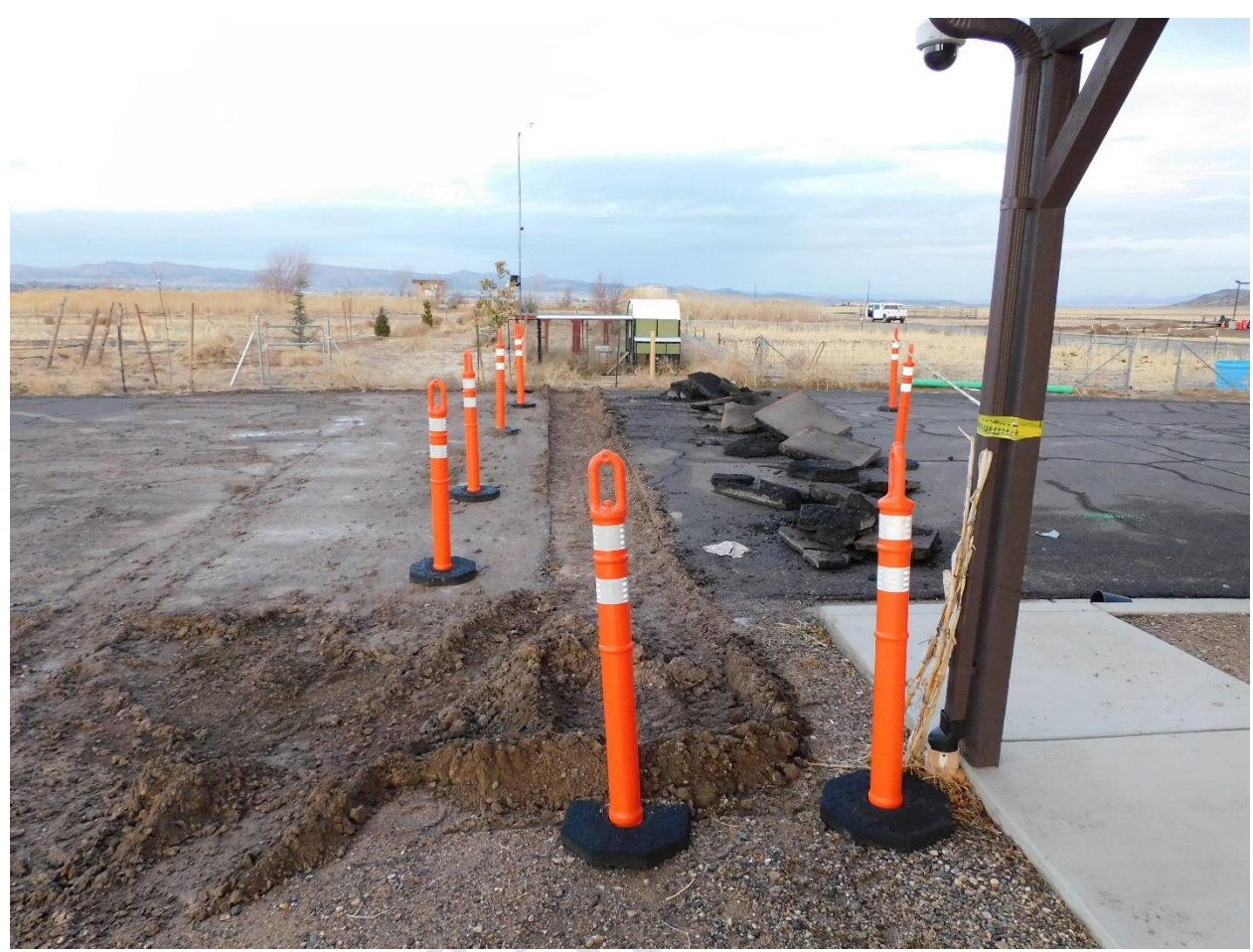
Bringing electrical service from Building 55