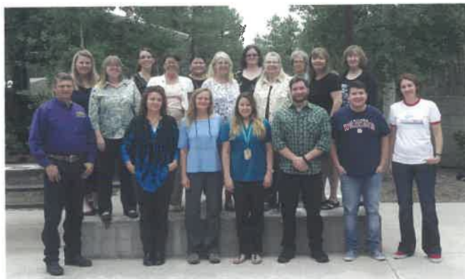
AZTransfer Facilitators at the 2017 annual training retreat in Flagstaff, AZ.