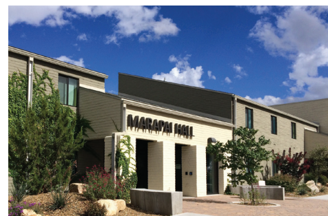
Marapai Residence Hall on the Prescott Campus.

Residence Halls are staffed with on call Resident Assistants each night. Resident Assistants are there to help students, offer programs and help address safety issues. Each student is issued a key for his/her room. For personal safety and security of valuables, students are encouraged to always lock their rooms when leaving. The College Police and Residence Hall Directors offer presentations pertaining to safety and security awareness.