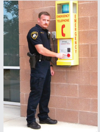
Emergency "Blue Light" phones found on campuses.