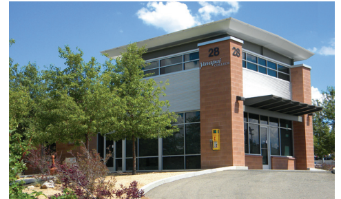
College Police Department is located in Building 28.

The College Police Department on the Prescott Campus is located inside Building 28, which is the first building on the right side of Marston Avenue as you enter from Sheldon Street. The College Police at the Verde Campus is located at the South end of Building F.