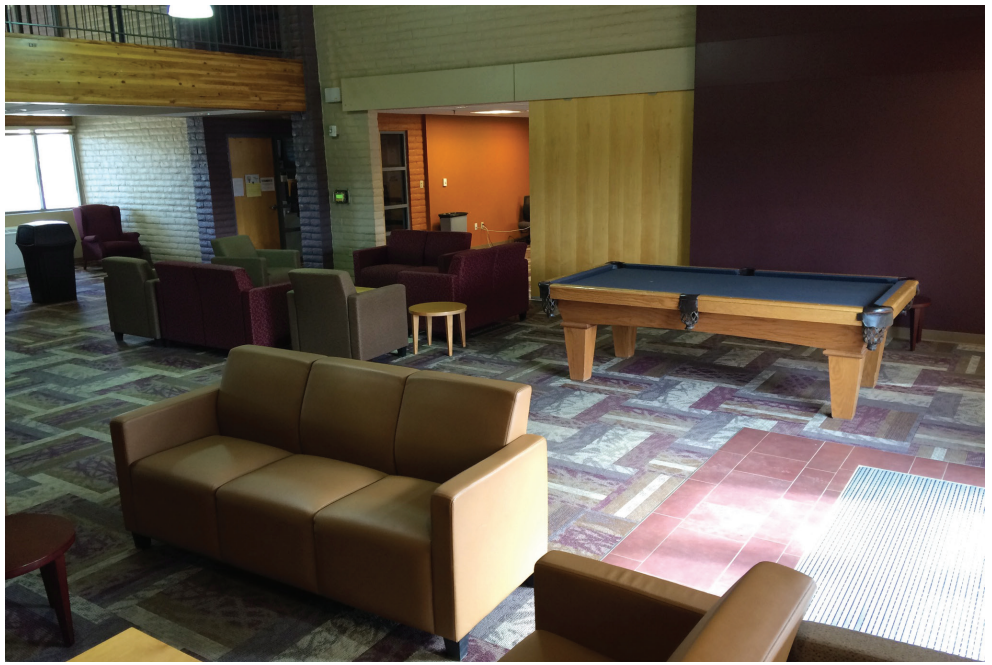
Kachina Residence Hall.