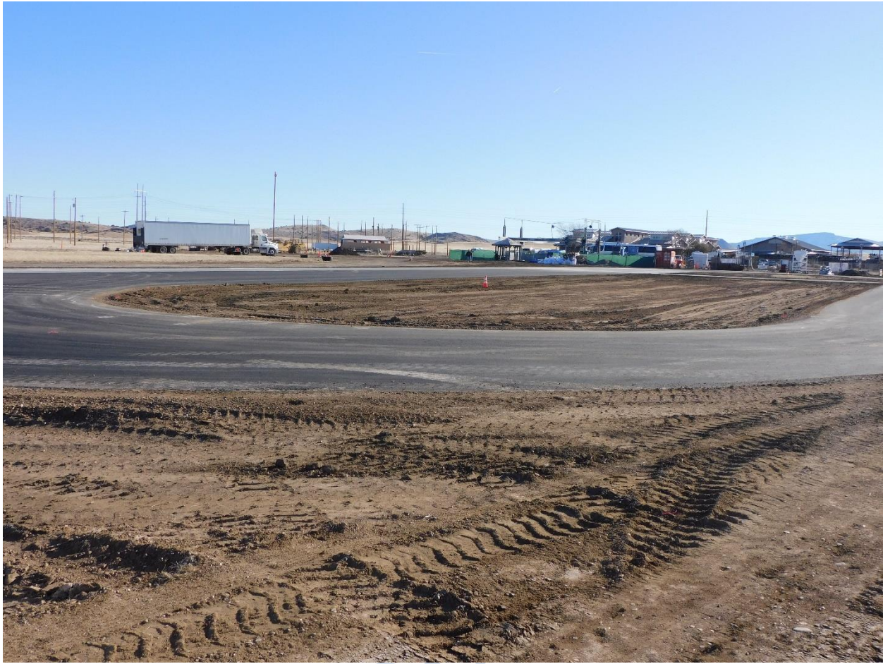
CDL Track at Chino Valley Agribusiness Center