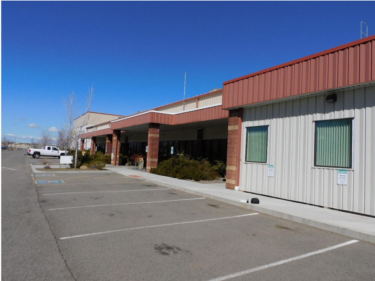
CTEC roof repair and façade replacement

The leak repairs and façade replacement are complete.