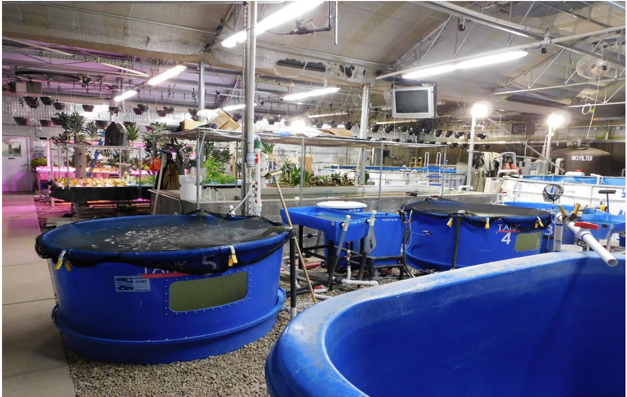
Chino Valley Agribusiness Center greenhouse programs