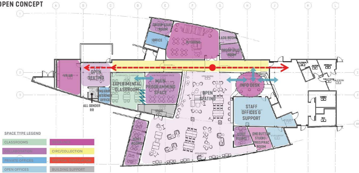
Building M Center for Learning and Innovation