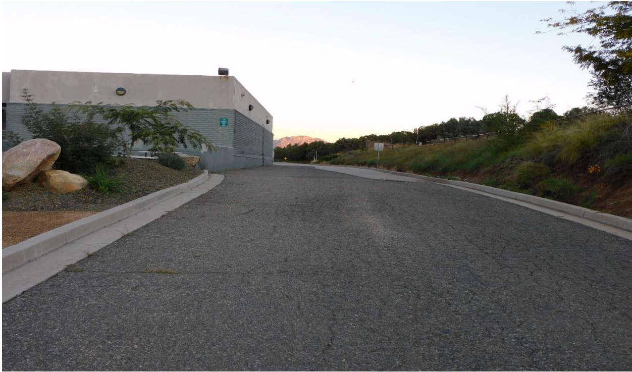
Roadway being replaced behind building 4