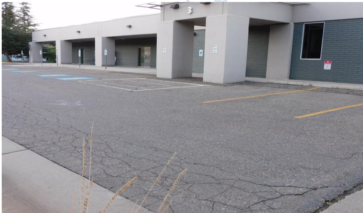
Roadway being replaced behind building 3