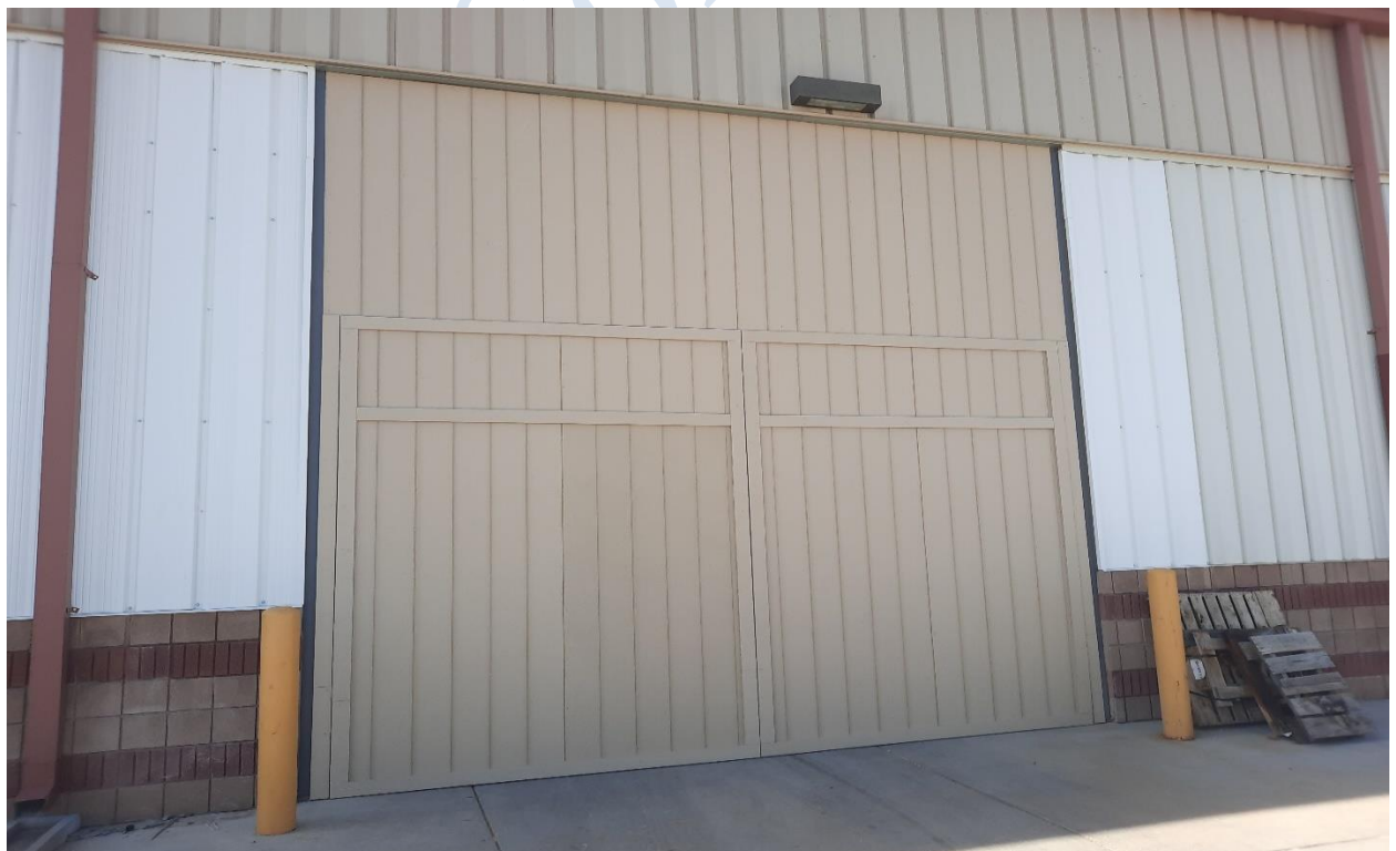
Completed temporary door