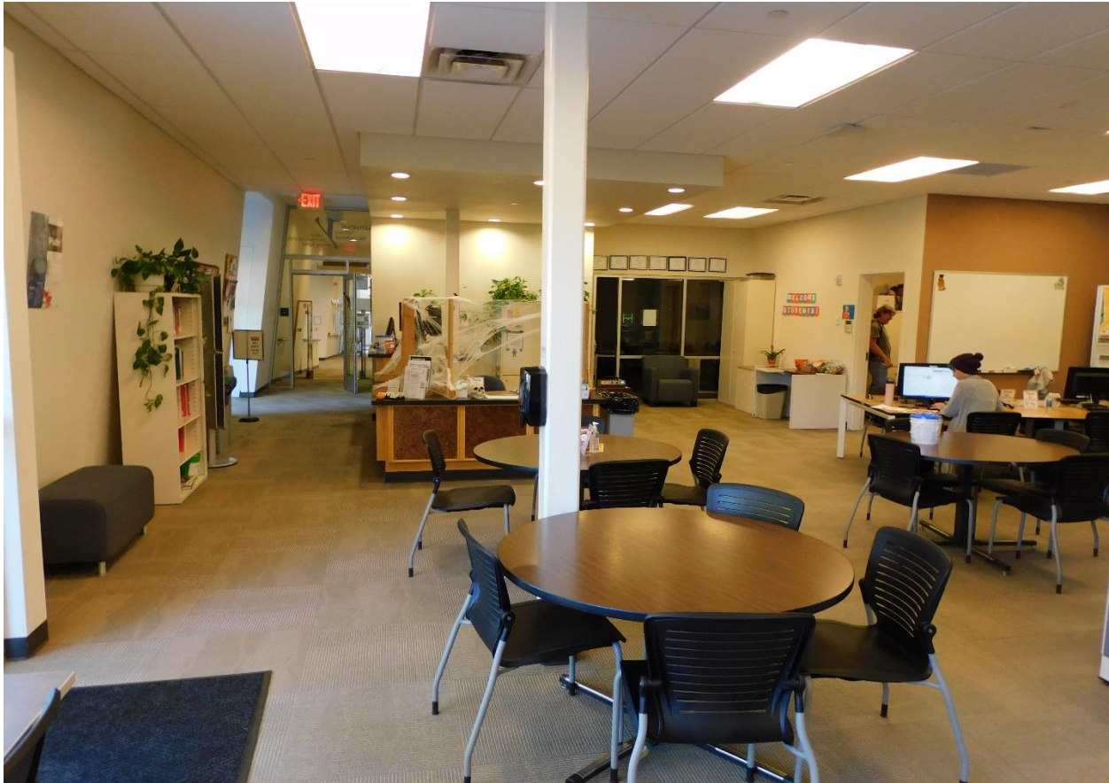
Building M Learning Center

For more information about Yavapai College's Facilities Master Plan, please visit the master plan website: https://masterplan.yc.edu/