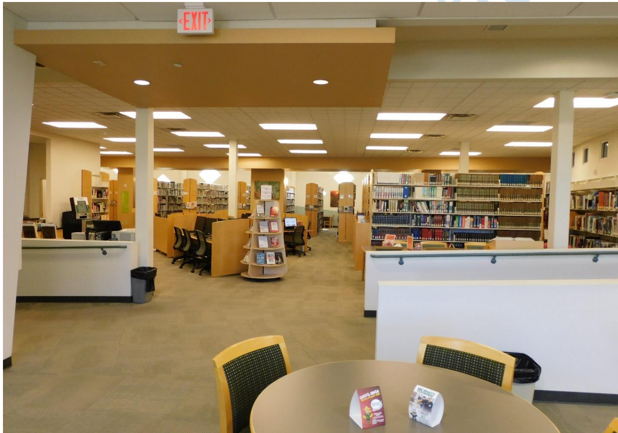
Building M Library

Verde Valley Skilled Trades Center Brewing and Distilling – postponed Digital Learning Commons Verde Valley – programming/visioning kicked off October 13 Mingus Union HS Athletic Field Improvements – in process Building 3 Rider Diner Improvements – Phase 1 Furniture install December 2022 Commercial Driving Track (Chino) – design complete/construction start November 2022.