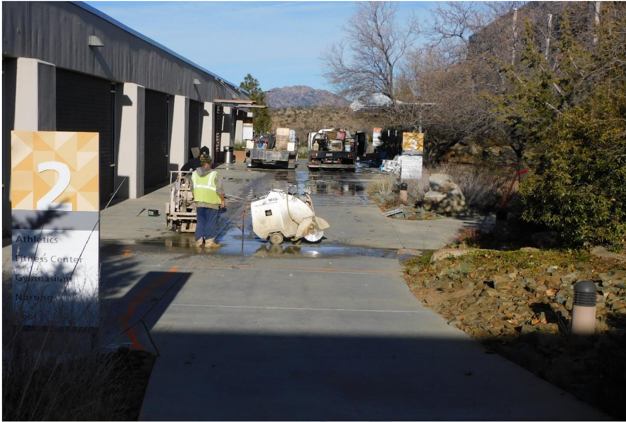
Damaged concrete demolition