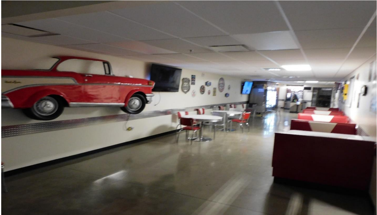
Area to be expanded

Work is projected to begin in the spring of 2022 to increase dining by expanding west, creating additional seating.