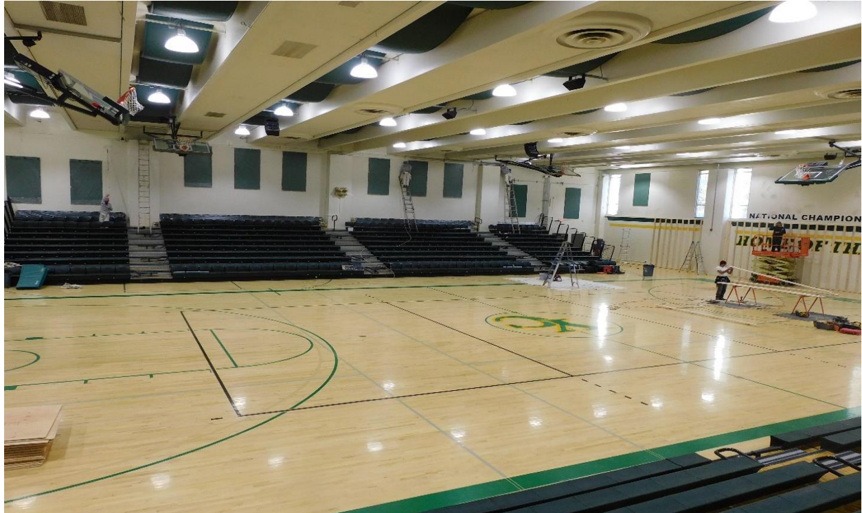
Gym in Building 2

Verde Valley Campus Building F Kitchen Equipment Upgrades–January 2022