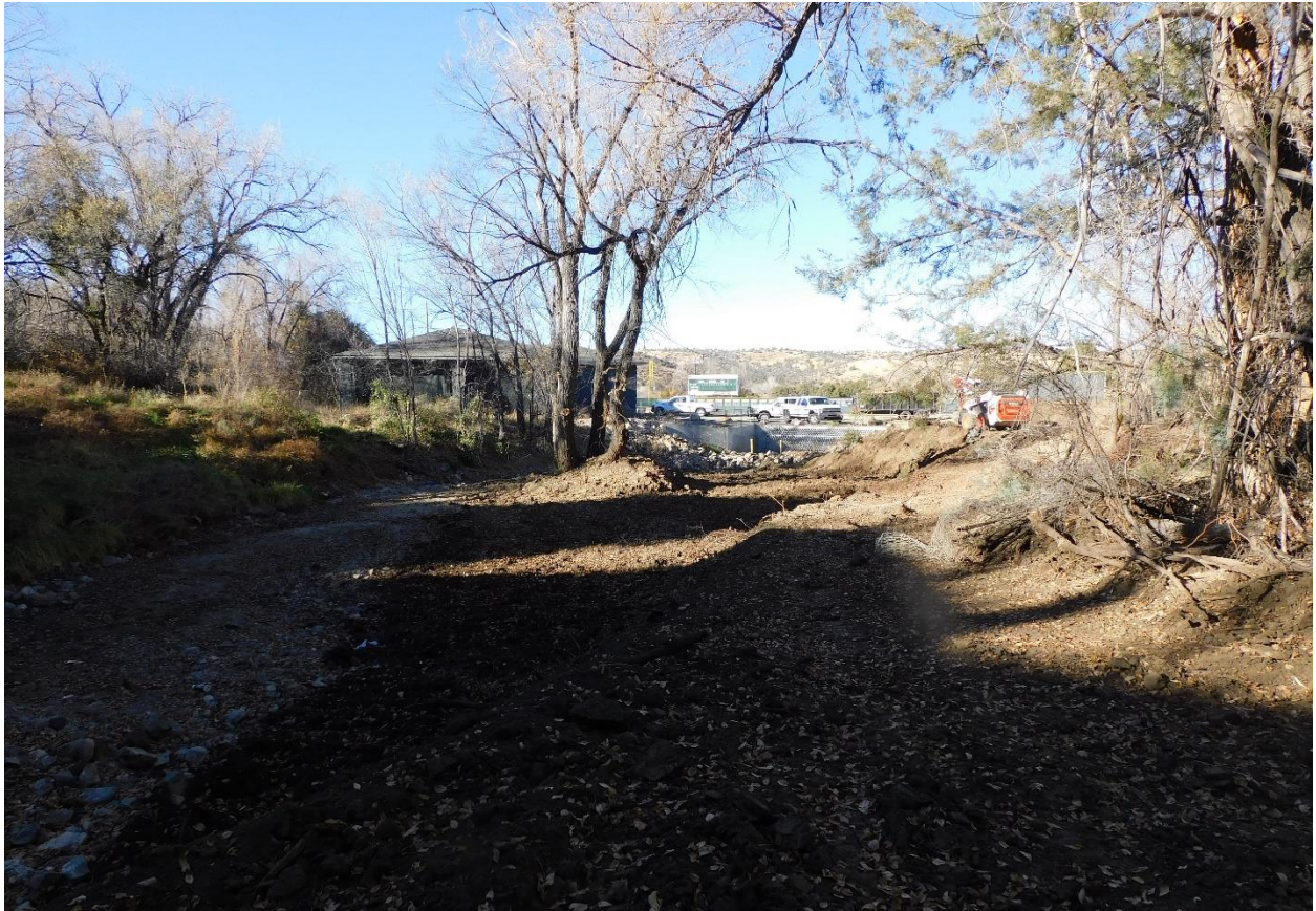
YC trail connection near the baseball field