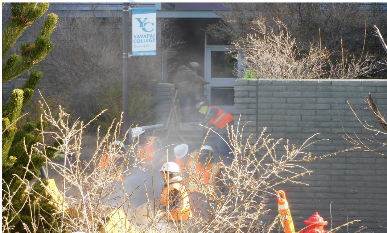
Building 2 west stairwell demolition