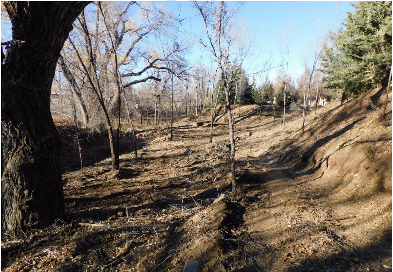
Upper end of the trail approaching Sheldon Street